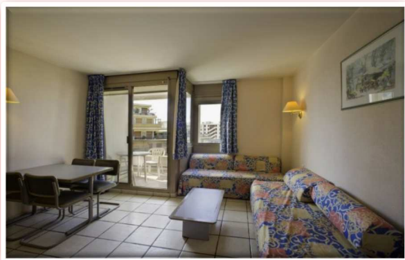
A room at Couleurs Soleil

Telephone: Upon arrival, after being accommodated students will be given the phone number of their room.