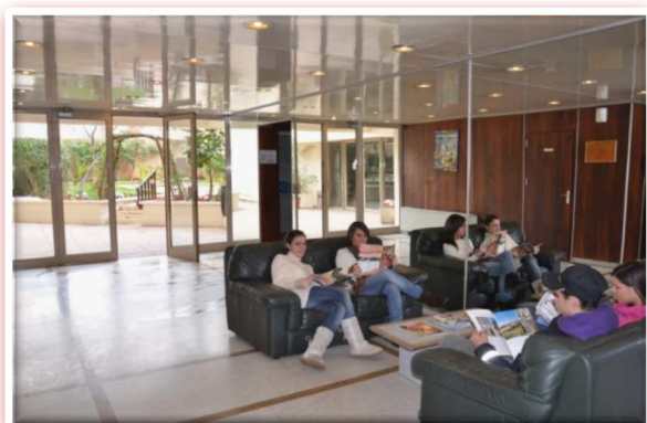
Reception at Couleurs Soleil